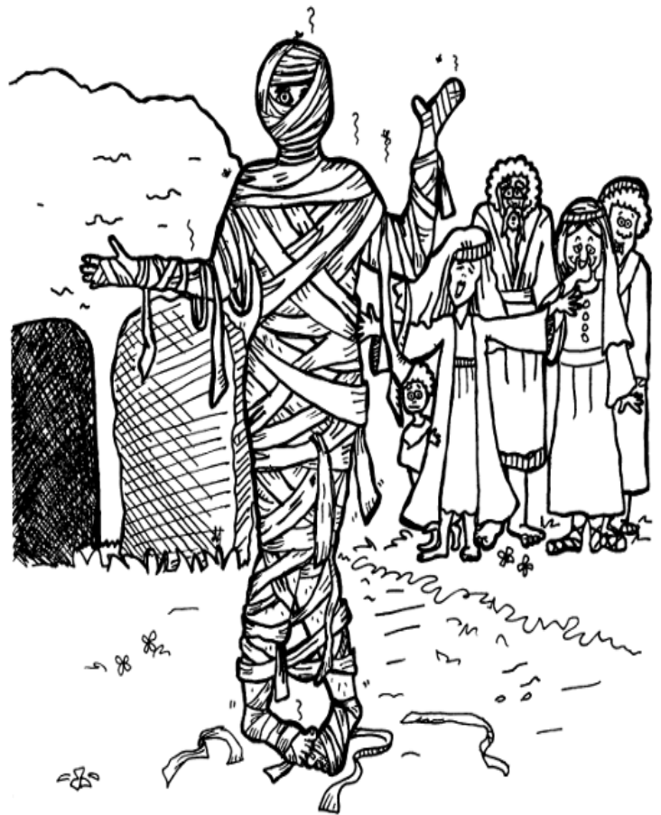
"Jesus raises Lazarus." John 11:1 - 44

Can you find your way through the maze to the tomb where Jesus will raise him from the dead?