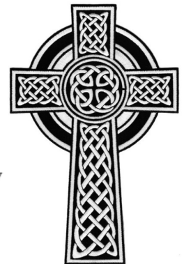
The Celtic Cross

The reflection from the Gospel Weeklies would be read this week if we did not have the Scrutinies.