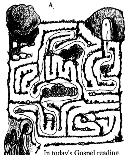
In today's Gospel reading,